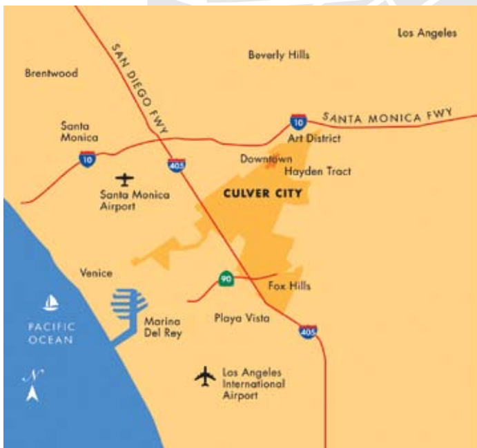
Brought to you by the Culver City Redevelopment Agency